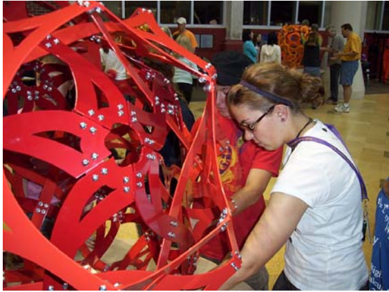
Figure 6: Sculpture barn raising activities.