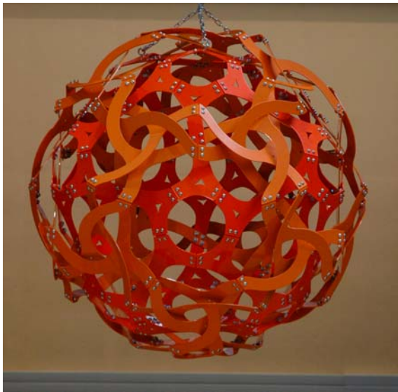
Figure 7 (begins): Comet! nine individual orbs