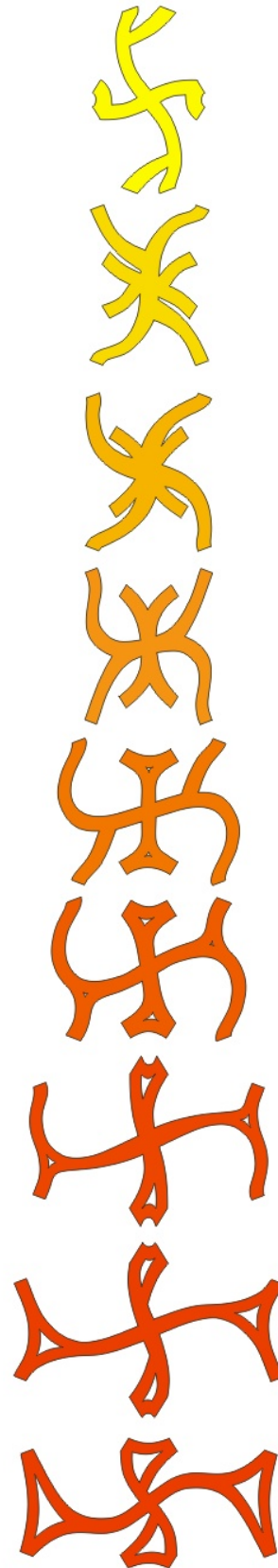
Figure 4: Nine orbs' component parts

To deal with the assembly-day logistics of making nine distinct orbs simultaneously, we expanded the faculty committee by a dozen members. Each orb involves a highly