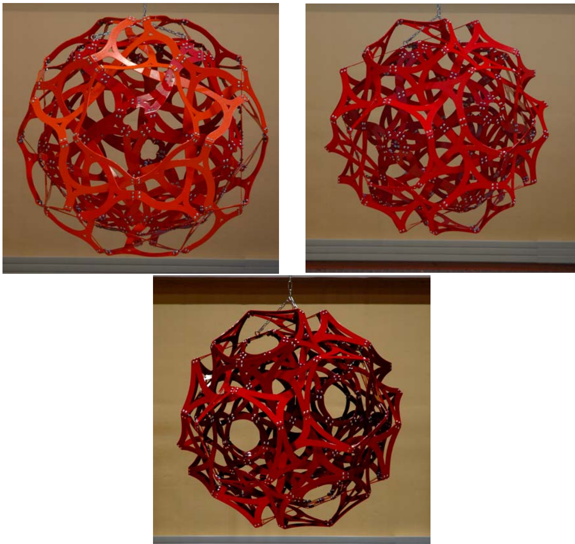
Figure 7 (continued): Comet! nine individual orbs