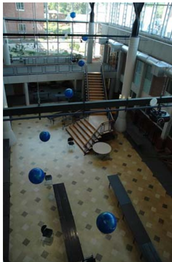
Figure 2: Helium balloons, for positioning

I was first contacted early in 2005 by Albion faculty with the idea that their new Science Center would be enhanced by the inclusion of a mathematical sculpture. After some discussions and planning, I visited the campus in October 2006 to present a talk on mathematical sculpture and view the site. On seeing the atrium space, I was attracted to the architectural design, which includes a floating bridge with a floating staircase down to the ground level, plus a well thought-out four-story staircase with varied projections into the space. Large glass walls to the outside and windows from surrounding offices allow viewing objects in the space from additional points of view. My main concern was the large size. I didn't think I could make something sizable enough to fit properly in such a vast volume. In discussion with the core group of Albion faculty on the project—David Reimann, Darren Mason, and Gary Wahl—we came up with the idea to have a multipart sculpture which would span across the space. They wrote a proposal for funding the project, emphasizing interdisciplinary connections between mathematics, computer science, and the arts, and pointing out the value of a public sculpture barn raising to the academic and broader community.